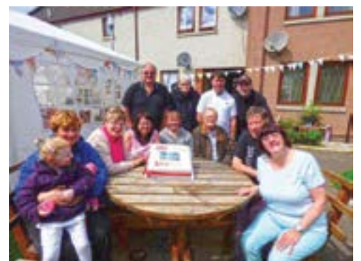
Happy 30th Anniversary