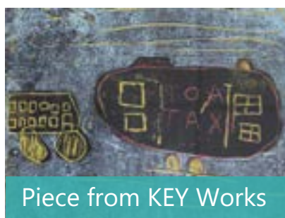
Piece from KEY Works