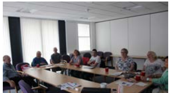
My Home Group discussing car parking

At our meeting in April, the My Home Group looked at our guidance around car parking in our developments across the country. After this meeting we have been able to put together a guidance leaflet for our tenants.