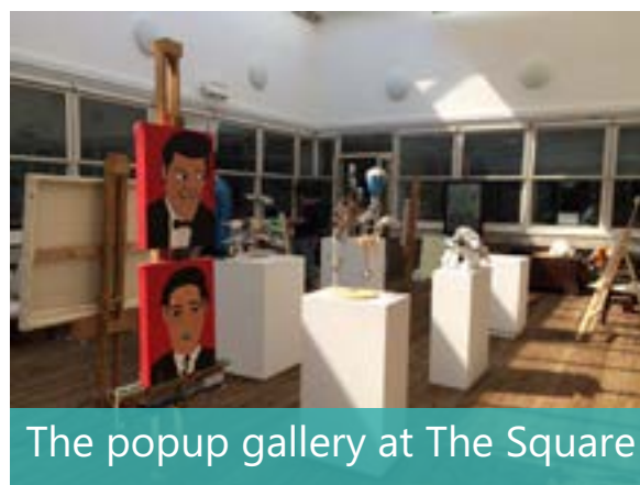
The popup gallery at The Square

At the same time, 'KEY Works' was exhibited - an art sale of pieces created by people supported by KEY. Project Ability helped them develop their skills.