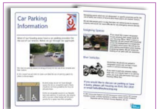
Our new car parking leaflet

The full details of our car parking policy is in the new leaflet. If you would like a copy posted out, please call Housing on 0141 342 1810.