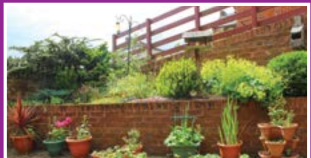
Mary's botanical courtyard