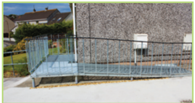
Pictured above: The newly fitted kitchen and outdoor ramp

If you feel you would benefit from an adaptation to your home please contact your Housing Officer on 0141 342 1810.